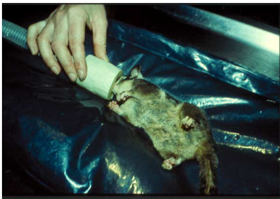
Figure 3. Chemical restraint of a Leadbeaters possum with isoflurane via mask and T-piece. Until induction is achieved, the animal is restrained in a bag, with its face exposed for application of the mask. This mask is made from a plastic bottle with surgical glove taped over the opening. A nose sized hole is cut in the glove.

Treat foods include a range of fruits and nuts but these should never exceed 15% of the diet (eg, apple, nectarine, melons, grapes, figs, sweet corn, sweet potato, beans, pumpkin, sprouts, lettuce, broccoli, parsley 2 ). Acacia or eucalypt