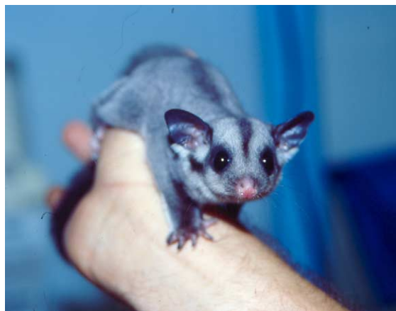
Figure 1. A recently weaned sugar glider in a zoo collection which has been habituated to handling.

Although nectar is not a major component of the wild diet, it is nutritionally similar to sap. A simple nectar mix can be made from 1.5 cups brown sugar, 0.5 cup glucose made up to 2 liters with warm water. A simple dry nectar mix can be made from 1 cup of rolled oats, ¼ cup of wheat germ, ¼ cup brown sugar, 1 tablespoon glucose powder, 1 tablespoon of raisins.