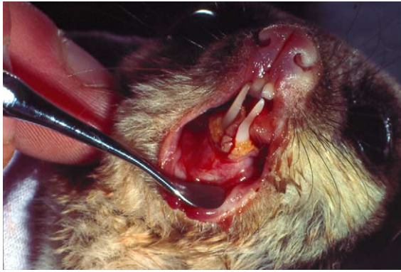
Figure 2. Tartar at the base of the lower incisors of a captive sugar glider.

Gum Arabic, which can sometimes be obtained from pharmacies, is gum derived commercially from an African Acacia species and provides a suitable approximation of this major component of the natural diet. The sugar gliders enlarged caecum is adapted to facilitate microbial fermentation of the complex polysaccharides obtained from acacia gum. 1