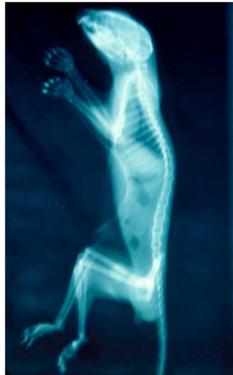
Figure 4. Whole body radiographs of a sugar glider, ventrodorsal and lateral views.